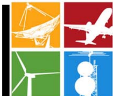
Competition for the Sky

September 29 - October 2, 2008 | Las Vegas, NV